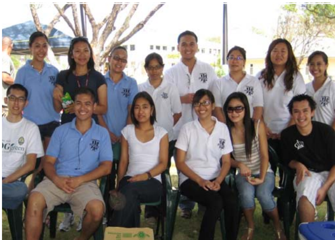
QUICK GROUP PICTURE - March 10, 2009 Charter Day