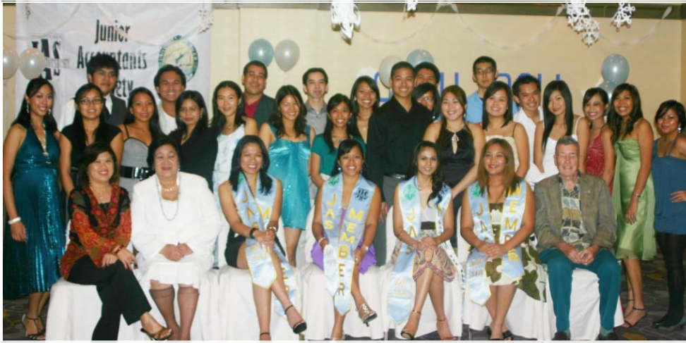
Junior Accountants Society Banquet - December 20, 2008