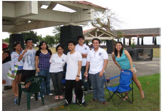
JAS Barbeque at Ypao Beach - February 21, 2009